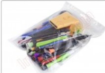
Set of professional tools for opening smartphones and tablets