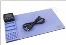
Heat-opening thermal mat, CPB320

For this tutorial you will need the following spared parts and tools that you cant get at our online store Impextrom.com Click on a tool for visit the website.