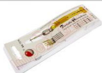
BK-7275 (A Version) 5 in 1 screwdriver