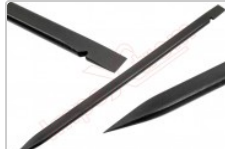
Opening tool Smartphone, tablet