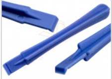
Terminal opening tool, plastic

For this tutorial you will need the following spared parts and tools that you cant get at our online store Impextrom.com Click on a tool for visit the website.