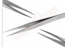
Professional fine point tweezers, ST-10