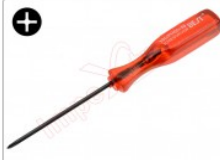
Screwdriver phillips Head Size 00