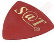
Special SAT 0.75mm high friction PVC pick