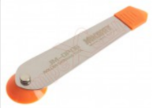
Opening Tool for tablets, smartphones, laptops and other devices

For this tutorial you will need the following spared parts and tools that you cant get at our online store Impextrom.com Click on a tool for visit the website.