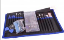
Kit of tools profesional 70 in 1 - ARTICLE NUMBER: LSP031634