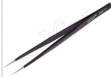
Pinza antiestática ESD redondeada