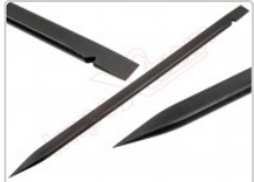
Opening tool Smartphone, tablet

For this tutorial you will need the following spared parts and tools that you cant get at our online store Impextrom.com Click on a tool for visit the website.