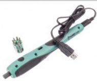
USB rechargeable wireless screwdriver