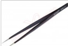
Pinza antiestática ESD redondeada