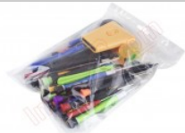
Set of professional tools for opening smartphones and tablets