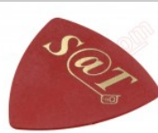
Special SAT 0.75mm high friction PVC pick