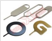
SIM card removal tool for all brands