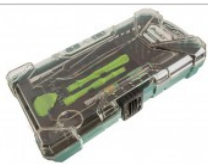
Smartphones and PC repair tool case