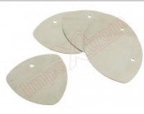
Set of 5 metal picks for opening