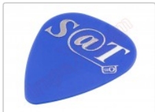
Special SAT 0.70mm PET pick, high friction and resistance