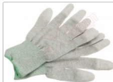
Touch ESD glove, for antistatic protection, size M