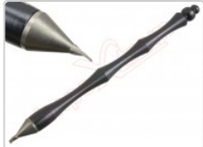
Head made of synthetic carbon steel with titanium handle

For this tutorial you will need the following spared parts and tools that you cant get at our online store Impextrom.com Click on a tool for visit the website.