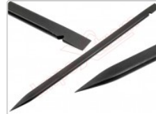
Opening tool Smartphone, tablet