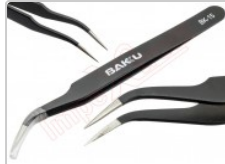
Pinza antiestática curva Baku ESD BK-15