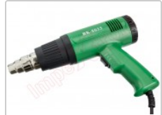
Stripper gun, hot air welder for repairs