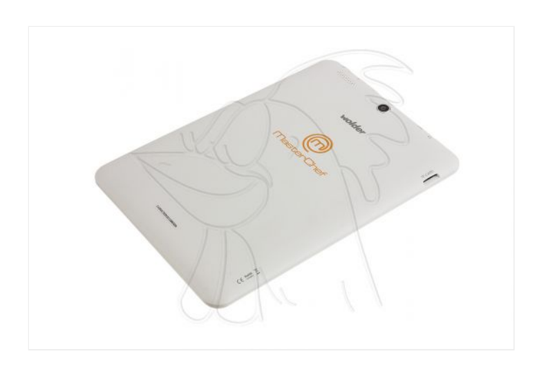
Step 2 - Back cover

To remove the back cover we must unhook the plastic notches located around the contour.