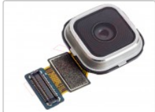
Flex with camera back of 12 Mpx for Samsung Galaxy Alpha, G850F

For this tutorial you will need the following spared parts and tools that you cant get at our online store Impextrom.com Click on a tool for visit the website.