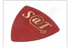
Special SAT 0.75mm high friction PVC pick