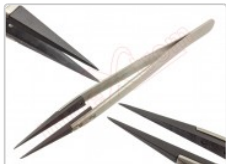
Electrical dissipating clamps, in blister